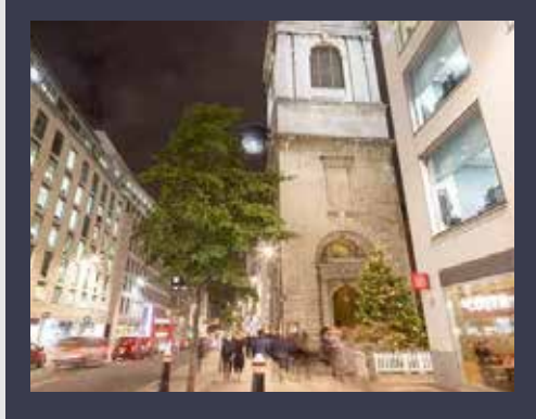
Billingsgate Roman House and Baths Tours run on Saturday and Sunday until Sunday 11 December 2016

With the City Academy Islington Choir performing carols.