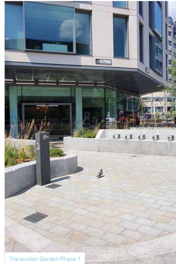
The sunken Garden Phase 1

CBA was delighted to continue their partnership with The London Festival of Architecture 2021, The City Benches competition. Emerging designers and architects were invited to take part in the competition and to draw up proposals for a series of one-off public benches which would enhance the public realm and visitor experience within the historic Cheapside district and City of London. This came at a pivotal time as the collection of benches offered a fresh new take on bringing people back to the city post pandemic and more importantly providing an inviting and safe space for people to enjoy within the capital.