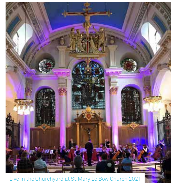
Live in the Churchyard at St.Mary Le Bow Church 2021

In the last year the Ambassadors have welcomed 39,636 visitors to the area.