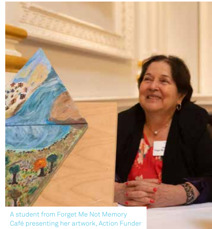
A student from Forget Me Not Memory Café presenting her artwork, Action Funder

Grants of up to £5,000 were made available for community groups and charities of all shapes and sizes.