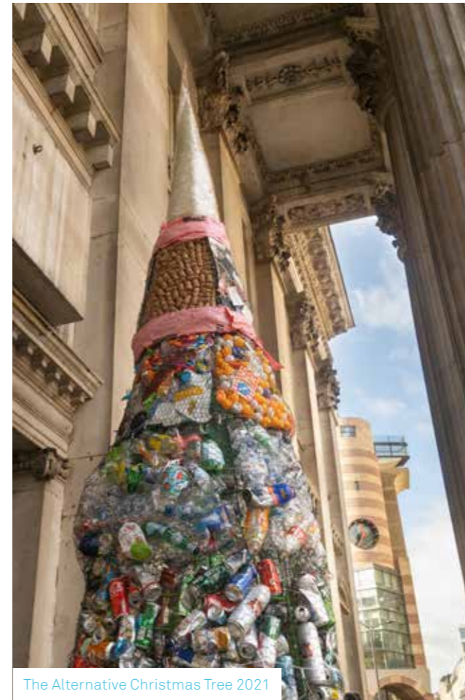
The Alternative Christmas Tree 2021

Cheapside achieved 101 plays (Soundcloud and Spotify combined) so was one of the city's most played podcast.