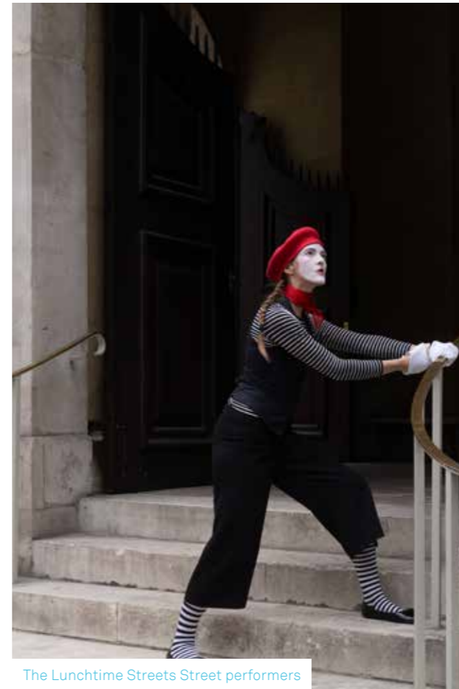
The Lunchtime Streets Street performers