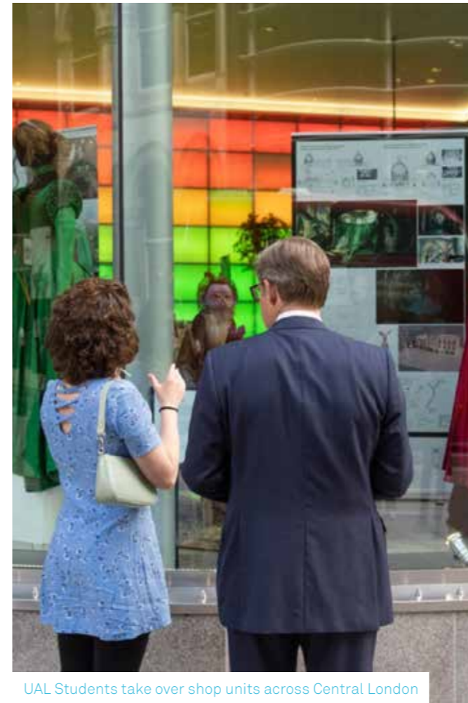
UAL Students take over shop units across Central London

At Canon Place, 78 Canon Street, work from all 3 courses was visible from the street in an impressive display. Pieces included a marionette theatre and mannequins with costumes for La Belle et La Bete, Wicked and The Wizard of Oz and special effects models and At One New Change shopping centre, the windows of 3 retail units presented costumes, designs, and a floor-to-ceiling exhibition of multiple set design visuals.