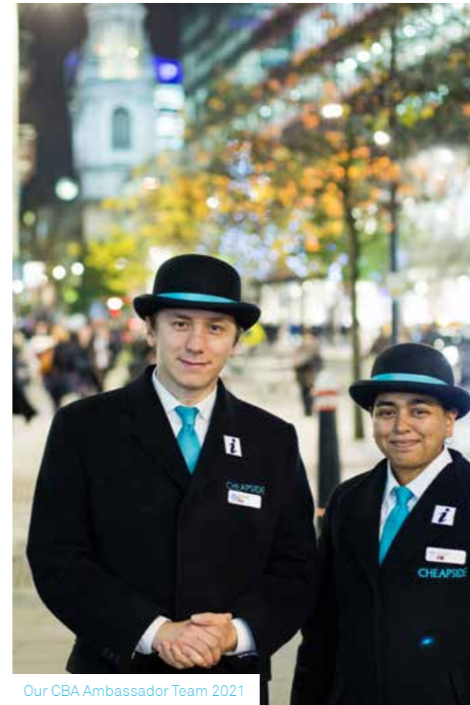
Our CBA Ambassador Team 2021

On this day the team walked the footprint, taking as many selfies as they could in order to engage with the local community as well as businesses. The Royal Exchange ran a fundraising rowing event on the day and many more businesses showed an interest in the event.